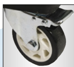
Nylon Castors for easy portability