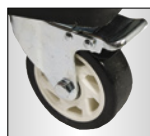
Nylon Castors for easy portability