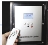
Remote Control Timer Panel

240V/50Hz/750W 3 speed motor Max. air flow: 23,000 m 3 per hour Water consumption: 20-35 litres per hour Effective cooling area: 200-260sqm Cooling area: 200-260m 2 Water tank capacity: 200 Litres 1800H x 1600W x 780Dmm Weight: 128kg