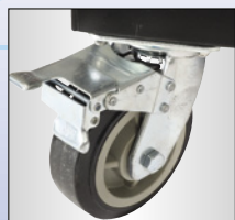
Nylon Castors for easy portability